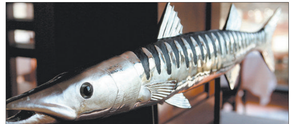
A snazzy barracuda is right at home as part of the oceanic decor.

Begin with appetizers of mussels diablo, calamari, cherrystone clams, scampi, crab cakes, shrimp ceviche or tuna tartare. One of the most requested starters is the classic oysters Rockefeller, prepared on the half shell with spinach, Parmesan, butter and parsley. There are nine main dishes, starting with almond-crusted grouper, bourbon molasses salmon, jerk swordfish, ahi tuna teriyaki, corn-crusted snapper, cioppino and scallops. Shrimp comes in island spices and a citrus sauce or in a sample of barbecued, coconut and scampi. But do-it-yourselfers will go for one of the more than 15 fresh fish options and pairings with one of the eight sauces, including Asian, bear-naise, lemon caper and citrus butter. The land options include Guinea