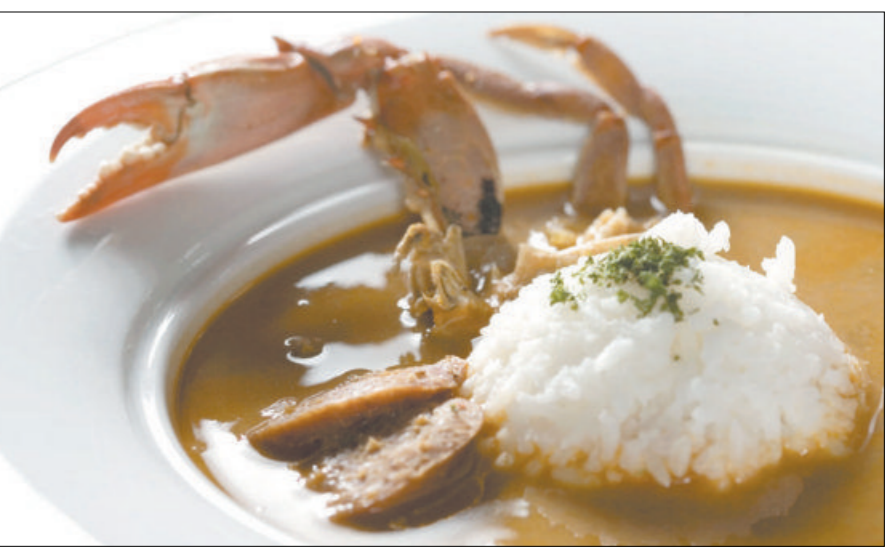
Gumbo is among the seafood favorites on the Louisiana-inspired menu at Se 'Vauge.