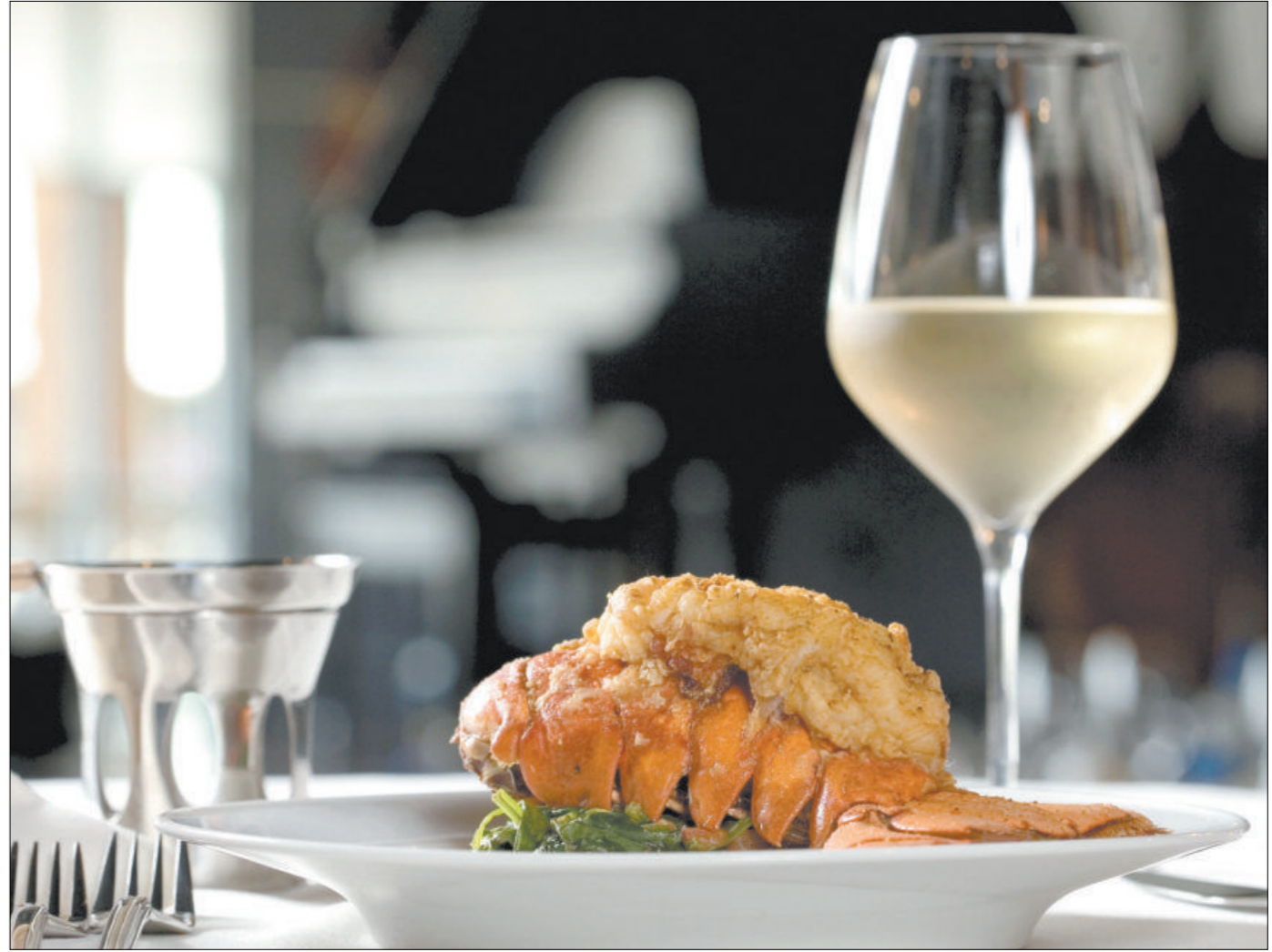
Seasoned lobster stuffed with crab, lobster and shrimp is served over sauteed spinach at Se 'Vauge in Roswell.